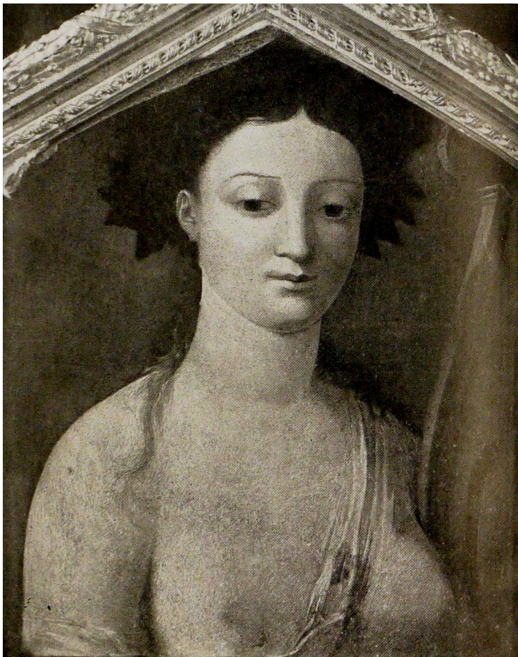
Nausicaa (See Preface).