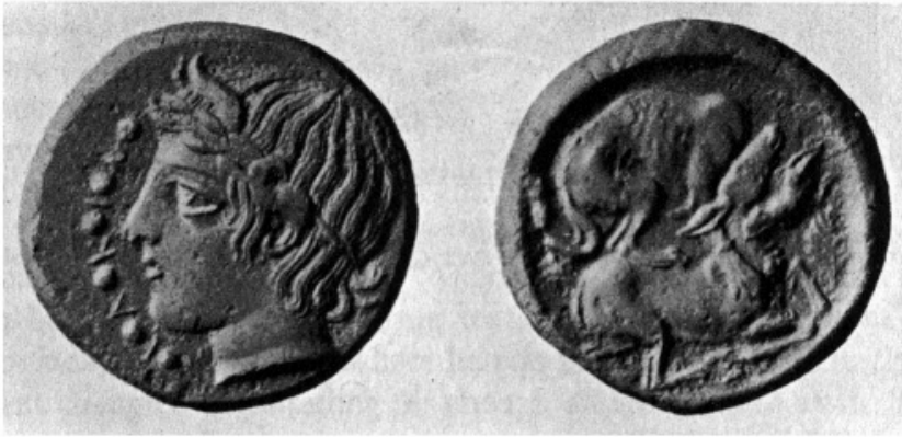
A COIN BEARING ON THE OBVERSE THE LEGEND IAKIN , AND ON THE REVERSE A REPRESENTATION OF THE BROOCH DESCRIBED BY ULYSSES Enlarged to about double the actual diameter

The British Museum possesses a unique example of a small bronze coin which is classed with full confidence among those of Eryx and Segesta. It is of the very finest period of the numismatic art, and is dated by the museum authorities as about 430 B.C.